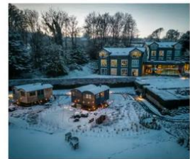
from page 22

Pictured anticlockwise from top: The Fortingall, Perthshire; The Hoxton, Edinburgh; Abelwood Lodge, Devon; Station Hall Railway Museum, York; Skate by the Lake at Another Place, Cumbria