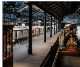
from page 18