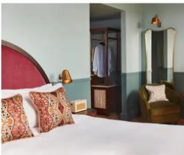
from page 10