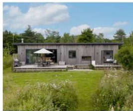
from page 14