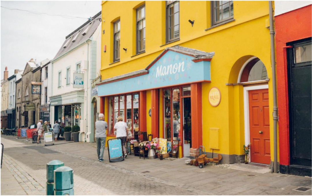
Llety Arall in Caernarfon has eight newly refurbished bedrooms; rest here as you plot a route along one of three Gwynedd Seafood Trails

Bangor University's School of Ocean Sciences has teamed up with the region's seafood purveyors to create the Gwynedd Seafood Trails, a trio of scenic routes, drivable over a few days, that show where to eat the local catch. For instance, combine Caernarfon's sites with lunch at Llofft and dinner at harbourside Morfarch. Take a walk from Borth-y-Gest before tucking into Bae Borth Deli Bar's seafood chowder. And graze around the lovely Llŷn Peninsula.