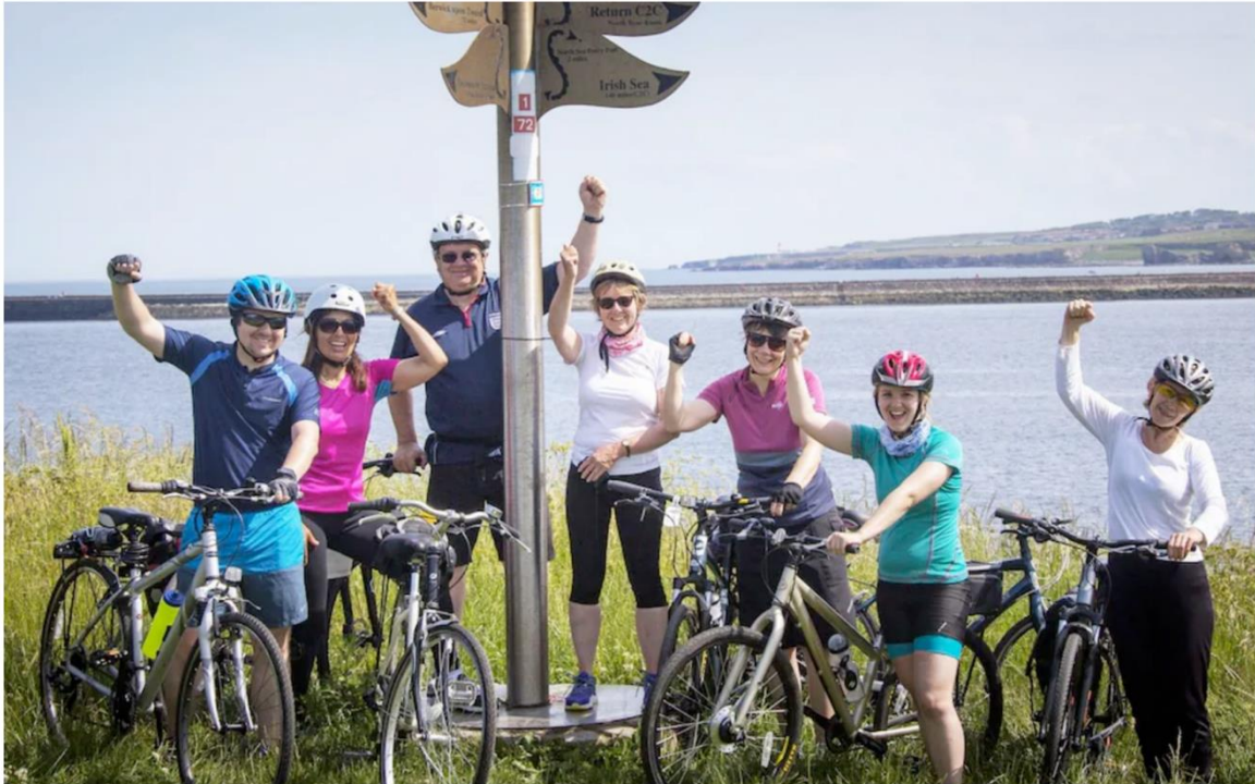
A ride along Hadrian's Cycleway is moderately difficult, but there is an option to hire an e-bike

Squeeze 2,000 years of history, 100 miles and a coast-to-coast crossing into just three days on a ride along Hadrian's Cycleway. The route follows country lanes, quiet roads and some traffic-free paths, passing ancient sites (Birdoswald Fort, Walltown Quarry, Vindolanda ) and offering views across the rugged North Pennines. It's a moderate-graded route – mostly manageable, with a few cheeky hills; hire an e-bike for an extra boost.