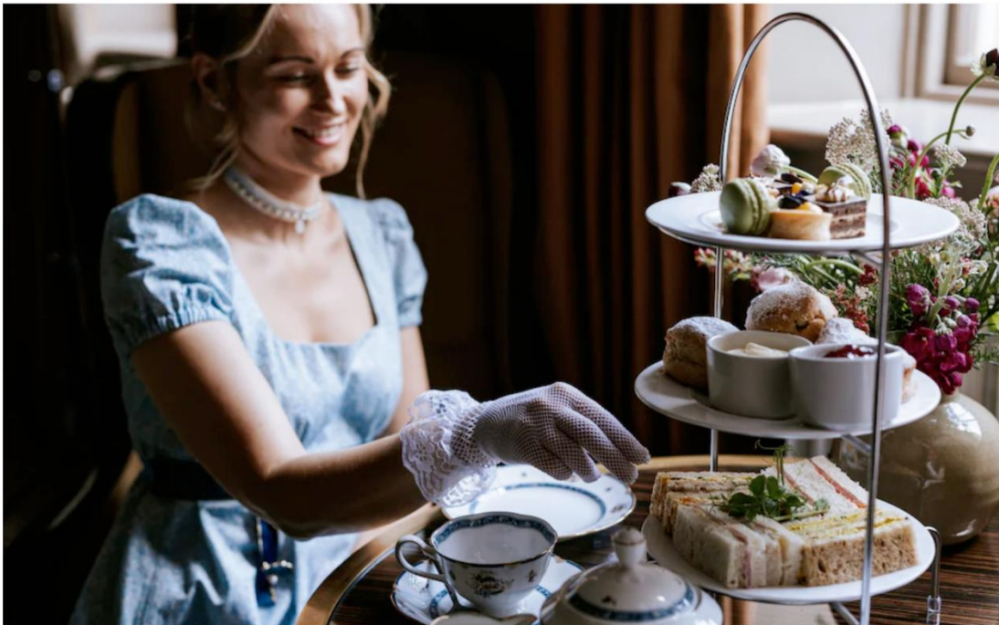
Celebrate the 250th anniversary of Jane Austen's birth with a visit to an exhibition in Bath

How better to celebrate the 250th anniversary of the birth of Jane Austen in 2025 than with a long weekend in beautiful Bath , the city that still looks like one of her novels. Of course, she didn't actually like it much – a theme explored at the No 1 Royal Crescent Museum's The Most Tiresome Place in the World exhibition, which looks at Austen's time in the city (until November 2, 2025). Stay just a few doors down at the elegant Royal Crescent Hotel & Spa .