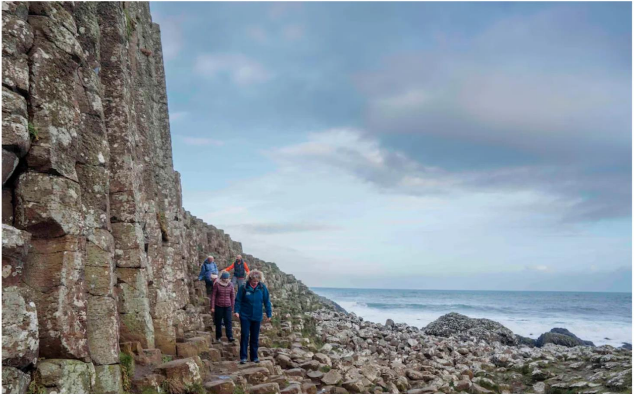
Head to the magnificent cliffs of the Giant's Causeway in Northern Ireland for a four-day self-guided walk

Amble along Northern Ireland's most iconic stretch of coast on a highlights-packed short walking break. The route runs from Portstewart to Ballintoy; between these two pretty towns lie Royal Portrush golf course (host of the 2025 Open), Bushmills Whiskey Distillery, ruined Dunluce Castle, views to Rathlin Island, cosy inns and the Giant's Causeway – the trail offers views of these Unesco-listed rocks without the crowds.