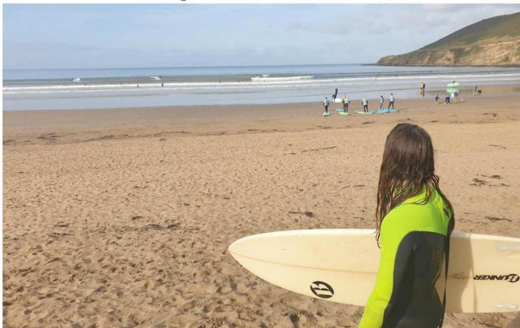
A package at Ocean Backpackers in Ilfracombe includes Pilates, yoga, surfing and beach meditation.

A weekend of coastal wellness doesn't have to cost a sickening amount. Look to hostels, which don't bump their prices in summer. These work brilliantly for groups and are usually in prime locations for accessing the great outdoors. Ilfracombe's Ocean Backpackers in Devon has smart shared and private rooms and also offers a bargain Ocean Mix & Match break that includes Pilates, yoga, surfing and beach meditation.