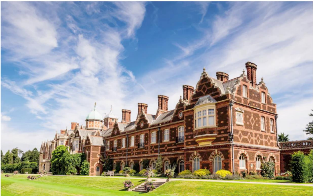
Sandringham House at the Sandringham Estate is the much-loved country retreat of King Charles III and Queen Camilla

Embark on a small-scale, great-value county-roaming rail odyssey, exploring Norfolk via its most charming trains. Ride the steam-hauled Mid-Norfolk and Bure Valley Railways, board the rural Bittern Line from Norwich to Sheringham and pootle along the coast aboard the heritage Poppy Line. There's also time for a Mississippi Paddle Boat cruise on the reed-fringed Broads and a visit to Sandringham, the opulent country retreat of the royals.