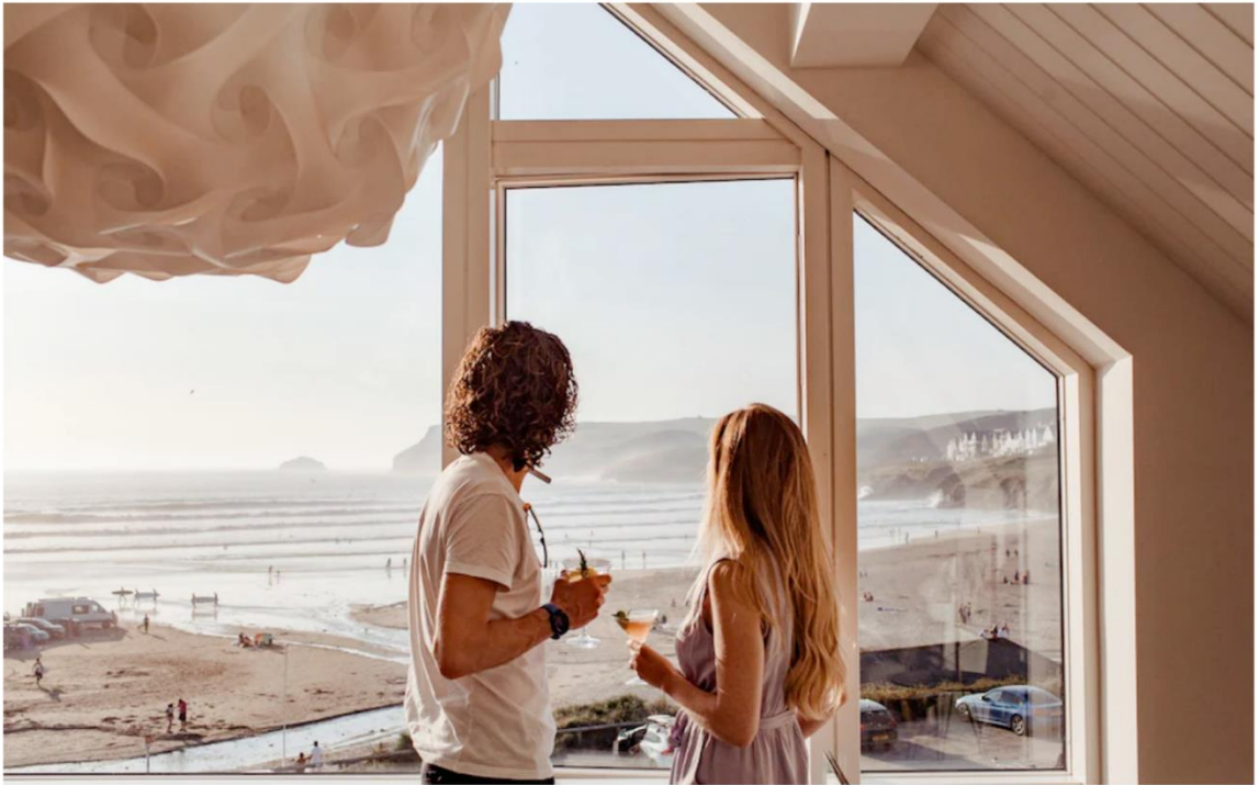
Head to 8-bedroom holiday let Chyanna for chic interiors and beach views

The height of Cornish cool, Polzeath was once dubbed ‘Britain’s Saint-Tropez’. There are certainly some glitzy places to stay, including Chyanna. Right opposite the enormous sandy beach, it’s almost entirely fronted by windows and comes complete with cocktail bar, sky hammock and outdoor kitchen on the balcony. For glamour at a lower-cost, come off-season: from September to April it can be booked for short breaks, and costs a quarter of high-summer prices.